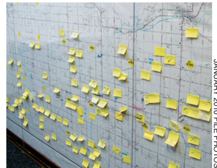
JANUARY 2010 FILE PHOTOS

A map of the eastern coverage area was dotted with notes detailing power outages in the area. The cooperative devised a color-coded system that helped bring a visual order to outages.