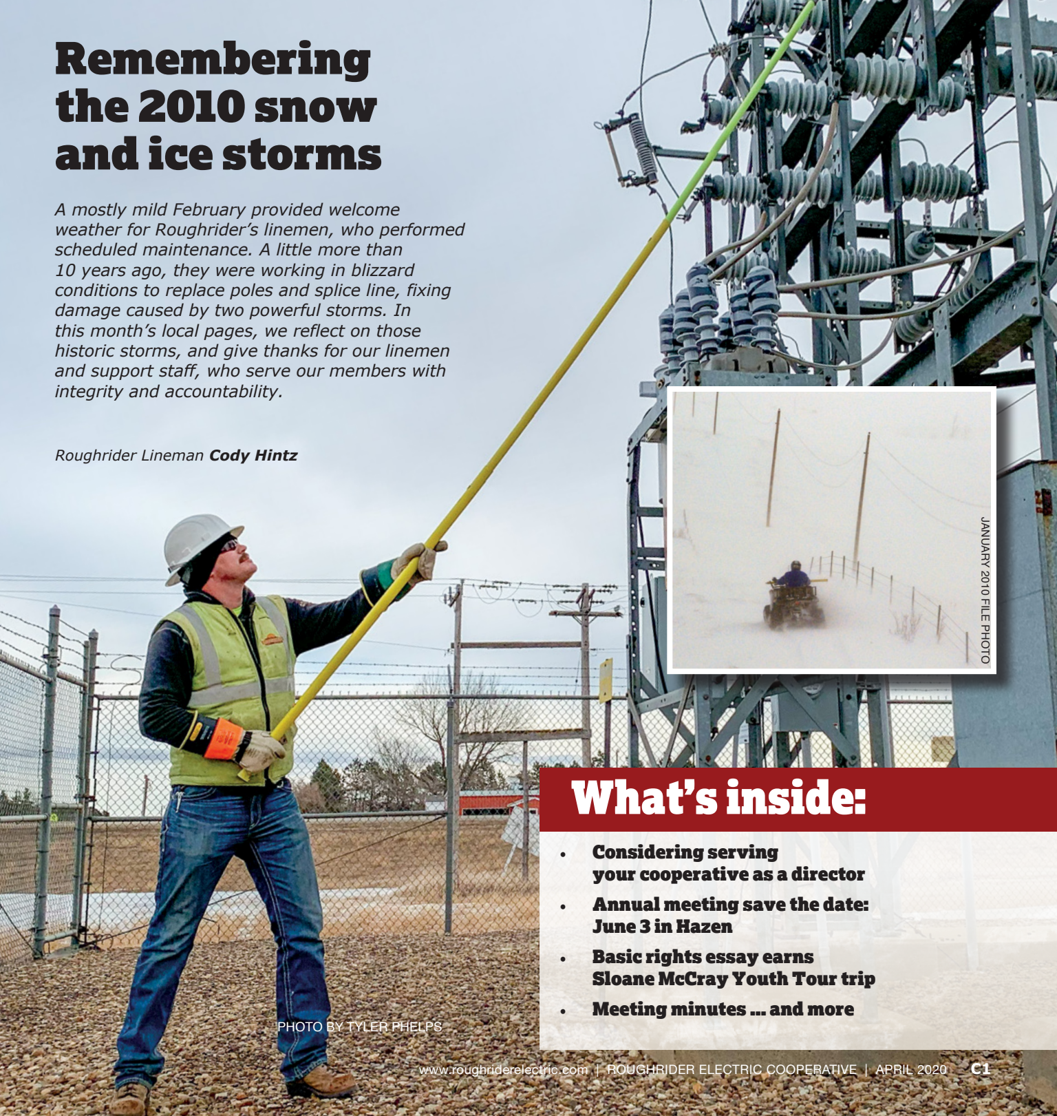
JANUARY 2010 FILE PHOTO